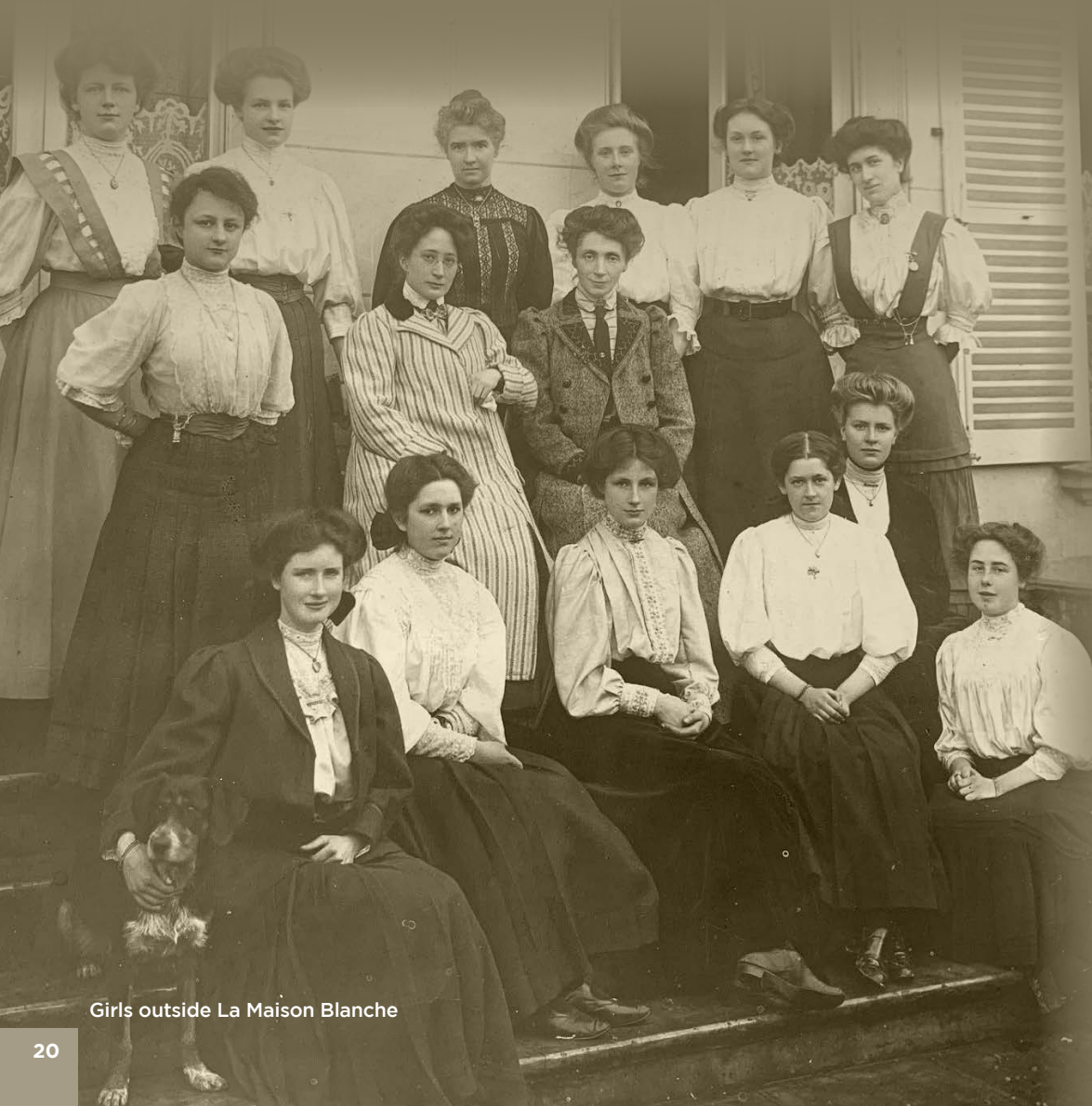
Girls outside La Maison Blanche

Sport for girls was at first not something that was felt to be properly ladylike, but this view was changing by the late-Victorian years, partly from the growing general feeling among women educationalists that girls should do just what the boys did.